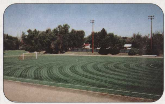
Lakewood (CO) Memorial Field/Jeffco Schools, High School Soccer Field of the Year

commitment to t h e sports turf industry? Submit