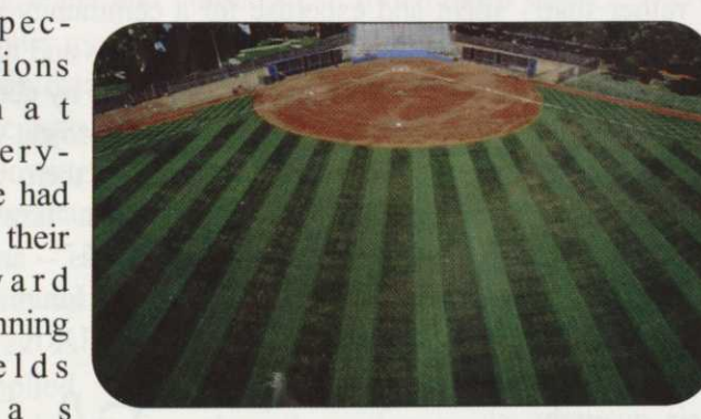
University of California-Davis, College Softball Field of the Year

my entire crew to renovate and submit other outstanding fields at U C Davis." That type of attitude typ-