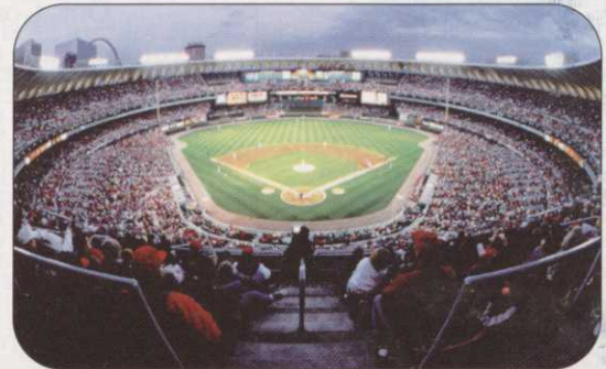
Busch Stadium - Home of the St. Louis Cardinals - See it for yourself on the Wednesday Seminar on Wheels Tour.

The Trade Show portion of the Conference will continue to be a two-day event with both a reception and luncheon in the booth area - giving you the extra opportunities to