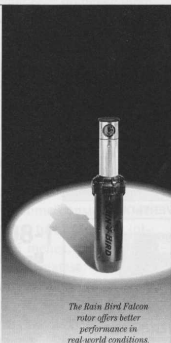
The Rain Bird Falcon rotor offers better performance in real-world conditions.

Rain Bird offers a full line of Falcon rotors for every application, including sports fields, cemeteries, schools and parks. For details on the Falcon rotor and the complete line of Rain Bird products, call 1-800-458-3005.