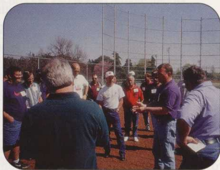
Great Plains: STMA, Wichita, KS

M aking it work - whatever, whenever, is a common theme for sports turf managers, whether it's whipping fields into playable condition despite difficult weather and heavy use, or putting together a dynamite meeting.