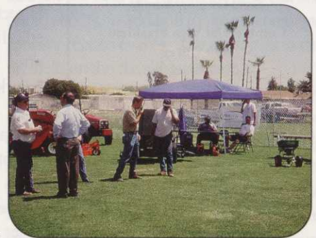
STMAAZ, Chandler, AZ

Eighty-four people braved a 10-inch snowfall to gather at the United States Air Force Academy's Falcon Stadium Press Box in Colorado Springs for