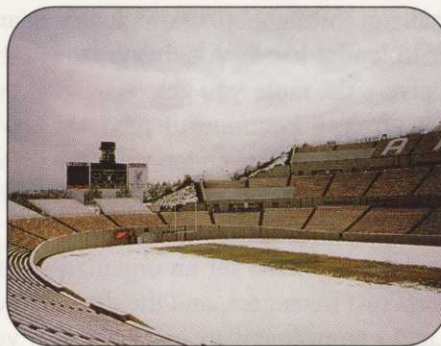
CSTMA, Colorado Springs, CO

A combination ice-breaker and headstart on networking opened the Wichita meeting with each individual "pairing off" with someone they didn't know. These pairs exchanged names and details about their facility and their position. Then, moving around the room, rather than introducing themselves, each of the 34 atten-