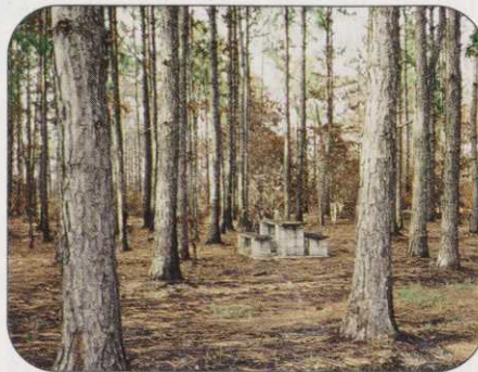
Picnic area at Ormond Beach Recreation Complex

but that the combination of heat (temperatures remain in the upper 90s even now), smoke and the smell of the actual fires made it difficult to be outside for any more than a couple hours at a time.