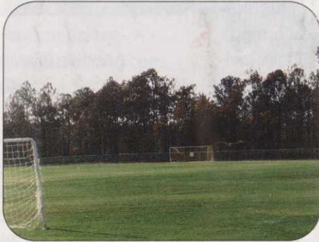
Soccer Field at Ormond Beach Recreation Complex

Y ou've seen it on the news -- the raging fires, the thick black smoke. You can imagine, in your own mind, the heat, the smell, the devastation. What would you do if this happened to you? Would your fields hold up under this kind of pressure? Would you? Here's a first-hand look at what a few of our members in Florida actually DID have to put up with - and how they endured.