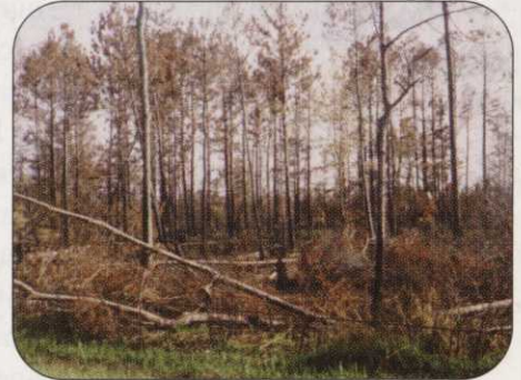
Next to the Parking Lot at Ormond Beach Recreation Complex

The Pepsi 400 at the Daytona International Speedway was cancelled because of the fires. Daytona Beach, which is usually