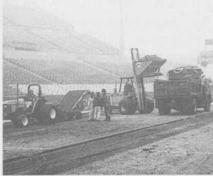
NEW ENGLAND PATRIOTS STRIPPED FIELD INSTALLED 2" THICK 48" ROLLS