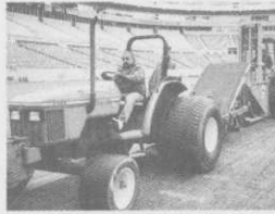
STRIPPED CAROLINA PANTHERS ERICSSON STADIUM