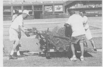
ST. LOUIS CARDINALS STRIPPED & INSTALLED 42"

FOR fewer, tighter seams stability and performance when you are ready to install, give CYGNET a call