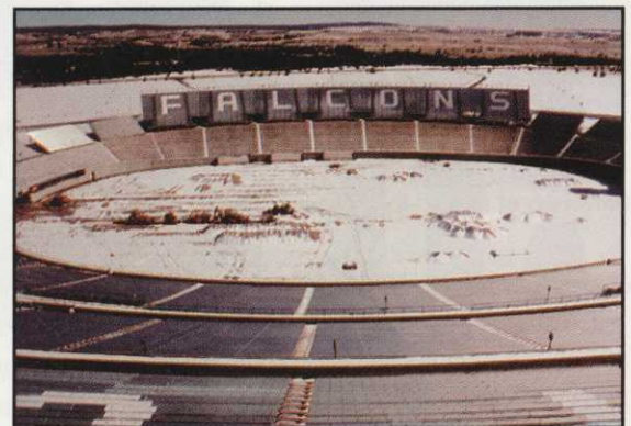
Last stop on the "kick-off" Seminar on Wheels was the Air Force Academy where the playing field was under reconstruction from a native soil to a new sand-based field.