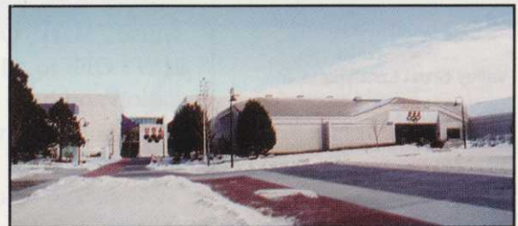
The first stop on the "kick-off" Seminar on Wheels in Colorado Springs took us to the U.S. Olympic Training Center where our group "christened" the brand new visitors center during the tour and made the evening news!

So, sit back and enjoy the newsletter - THEN - start making your plans to join us in Disney World next year.