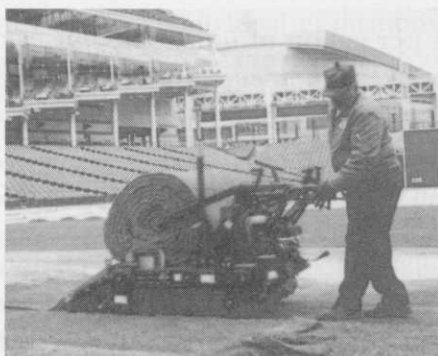
INSTALLED CLEVELAND INDIANS IN 42" AND 48" ROLLS