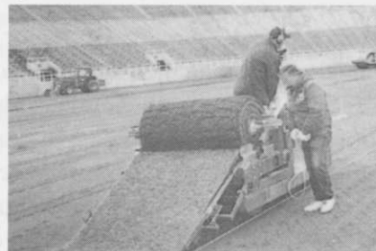
INSTALLED OHIO STATE (AND STRIPPED) 2" THICK TURF 48" ROLLS

FOR fewer, tighter seams stability and performance when you are ready to install, give CYGNET a call