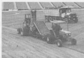
STRIPPED JACOBS FIELD CLEVELAND INDIANS