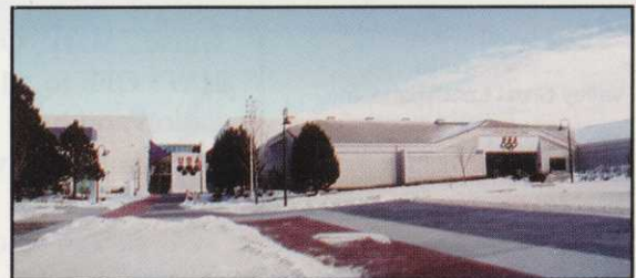
The first stop on the "kick-off" Seminar on Wheels in Colorado Springs took us to the U.S. Olympic Training Center where our group "christened" the brand new visitors center during the tour and made the evening news!

So, sit back and enjoy the newsletter - THEN - start making your plans to join us in Disney World next year.