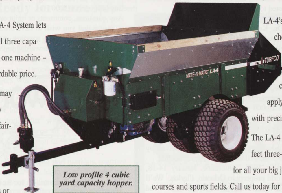
Low profile 4 cubic yard capacity hopper.

broadcast spread them with sand, lime, compost or gypsum. Tomorrow you may find out how its large capacity hopper and material handler make loading and filling so easy. With the LA-4, you get a system that can satisfy your future needs like back filling irrigation ditches, adding material to bunkers, or moving material to repair areas. No matter what the job, construction or repair, the