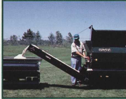
MATERIAL HANDLING Load machines, fill bunkers, move materials for renovation and construction.