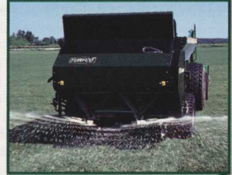
BROADCAST SPREADING Apply from 15' to 40' wide including gypsum, lime, and calcine clays.

Turfco's LA-4 System lets you have all three capabilities – in one machine – at one affordable price.