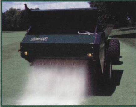
LARGE AREA TOP DRESSING Apply at rates from 1/32" to 4" for golf course fairways and sports fields.