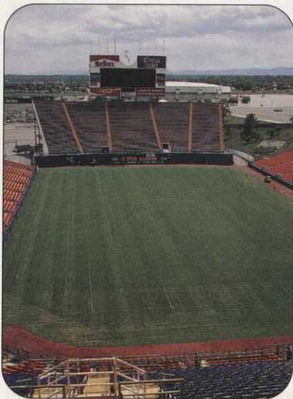
Mile High Stadium is one of our Sunday Seminar on Wheels stops.