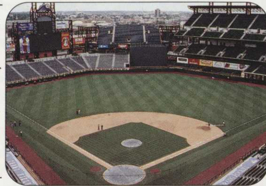
You'll also get a chance to visit Coors Field on Sunday.