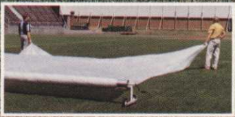
Unroll the cover...