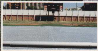
Put Evergreen to work!

COVERMASTER COVERMASTER COVERMASTER MASTERS IN THE ART OF SPORTS SURFACE COVERS