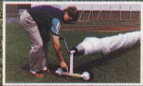
Lock in place...

Ideal for Quick Turf Repairs between Hash Marks and in Soccer Goal Areas