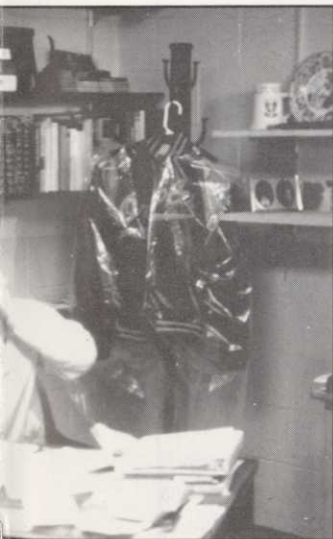
and Grounds at Holy Cross Eastern Sports Turf Institute ored by STMA and PGMS.