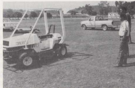
New Kubota radio controlled rotary mower.

Approximately 50 commercial companies were represented at the trade show this year with products, materials, supplies and equipment for the sports turf manager.