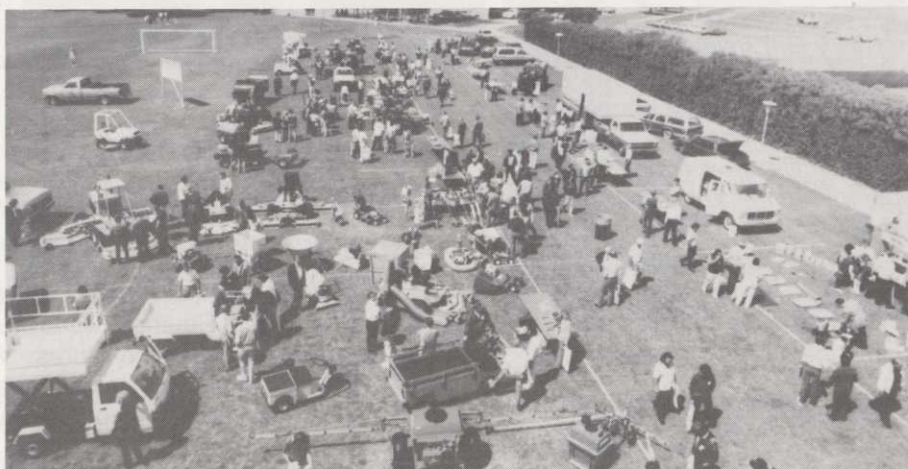
Cal Poly Sports Turf Trade Show--Outside exhibits