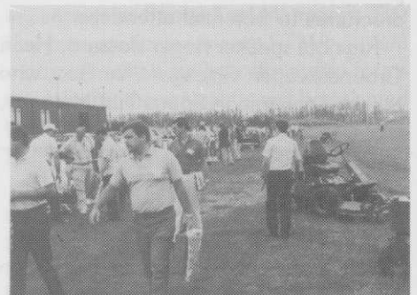
Trade Show on College of DuPage Soccer Field.

The Midwest Sports Turf Institute held at the College of DuPage on June 26th was attended by Sports Turf Managers and commercial affiliates from a multi-state area. The event attracted over 300 conferees and speakers from Washington D.C., California, Florida, Colorado, Nebraska, Iowa, Wisconsin, Michigan, Kansas, Missouri, Indiana, Illinois and Minnesota. More than 45 commercial companies were on hand to show products, equipment, supplies, and other useful items for sports fields.