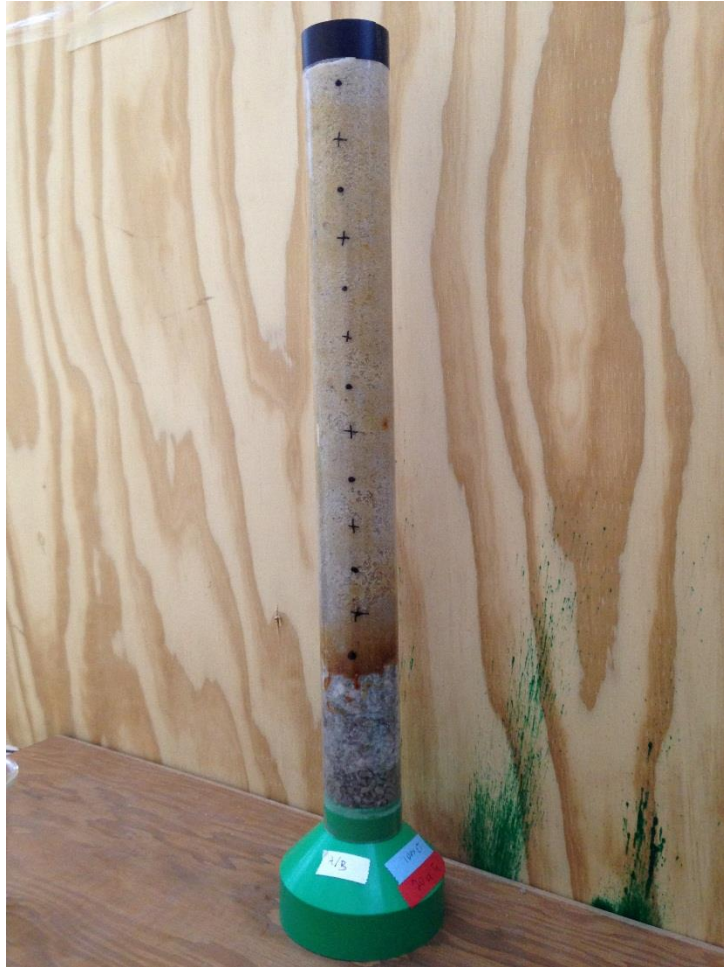
Figure 3. Iron-cemented layer at the sand/gravel interface of a root zone with a low-pH sand and a high-pH gravel. The column received eight total applications of Fe at a rate of 200 \text{ kg FeSO}_4 \text{ ha}^{-1} .