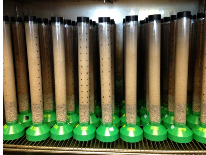
Figure 1. Columns were constructed to meet the recommendations of the USGA for putting green construction.

since the iron is immobilized before it reaches the gravel. The full-scale study will provide a wealth of information about how root zone chemistry affects iron accumulation.