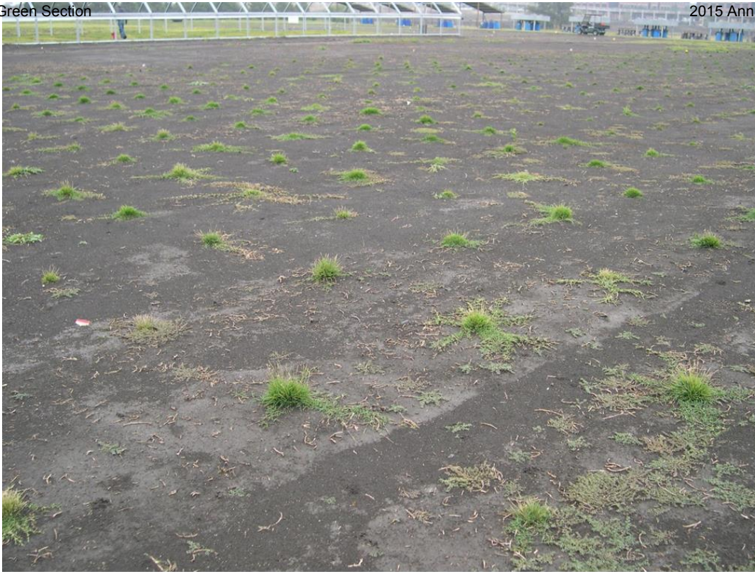
Figure 1. Third cycle of recurrent selection. A spaced plant nursery planted on 7/23/15 with 1,750 progeny.