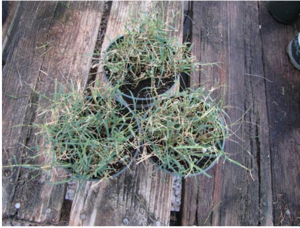
Grasses resistance to Acclaim