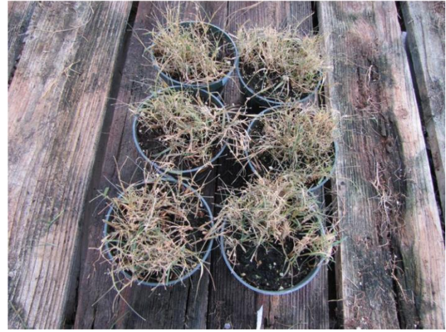
Grasses susceptible to Acclaim