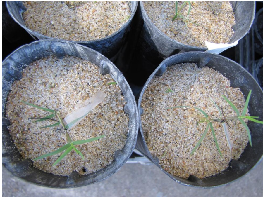
Fig 3. Bermudagrass plants prior to application of cold AOPP herbicide. Note the designated leaf that will be treated with isotope-labeled AOPP herbicide was carefully covered.