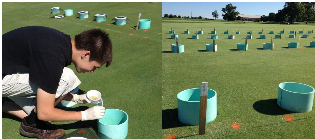
Figure 2. Infesting cages with black cutworm larvae after the turf was treated with formulations of AgipMNPV , 2015.