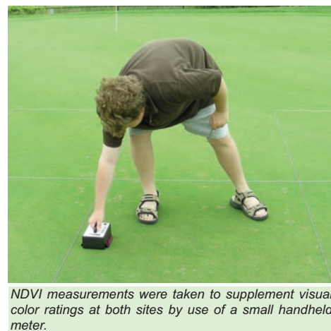
NDVI measurements were taken to supplement visual color ratings at both sites by use of a small handheld meter.

As expected, plots treated with Daconil Ultrex exhibited the best summer quality in both IL and MD since it effectively controlled the disease. Urea was the next best treatment, but urea-treated plots eventually were severely damaged by dollar spot. Except as noted below, none of the other treatments reduced dollar spot and plots treated with those products were damaged severely, resulting in poor turf quality in both IL and MD. In MD, however, some slight reduction in dollar spot