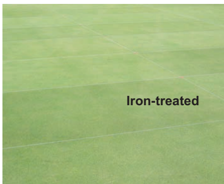
Iron darkened the turfgrass at both sites immediately after application and appeared as a checkerboard pattern across the study area where applied, but the effect was transient unlike urea.

Lessons learned in 2007 resulted in a change in the treatment structure in 2008. In 2007, IronRoots, Knife, Lesco's 12-0-0 Chelated Iron Plus Micronutrients (hereafter Lesco 12-0-0), PanaSea Plus, Ultraplex, urea and Daconil Ultrex were evaluated for their ability to suppress dollar spot. Except for Daconil Ultrex, none of the other products claim disease suppression on their labels.