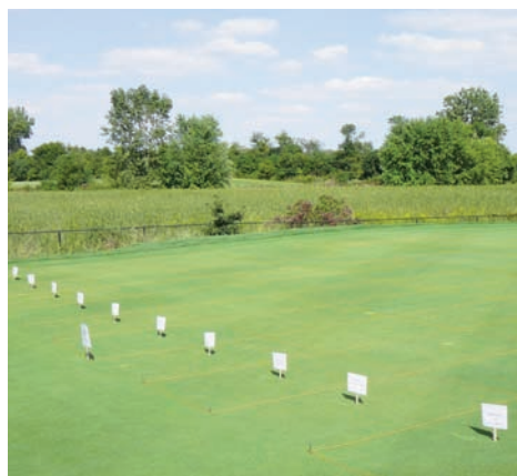
Both studies were conducted on USGA constructed bentgrass greens that were either a 'G-2' / 'L-93' blend (IL) or 'Providence' (MD).

Since PanaSea Plus, Roots Concentrate, and IronRoots contain no N, they were compared with and without N from urea. Therefore, urea was applied alone or tank-mixed with IronRoots, Roots Concentrate, and PanaSea Plus at 0.15 lb N/ 1000 ft 2 . All treatments were applied on a 14-day interval, except Knife which was evaluated at two rates applied on either a 14-day or 28-day interval as specified on the label. All products were tested at label rates and application intervals as specified on product labels. Both study sites were treated with fungicides in 2008 throughout the study period to control dollar spot and brown patch ( Rhizoctonia solani ). (continued on next page)