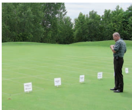
The first year, products were evaluated for ability to suppress dollar spot disease but were unable to do so at both sites.

IL and MD were very similar. When data were averaged over the season, treatments containing urea provided the best quality at both sites. There were no significant differences in color or quality in plots treated with urea alone compared to plots treated with IronRoots + urea, Roots Concentrate + urea, or PanaSea Plus + urea at either site. Hence, little or no benefit was observed by tank-mixing any of the biostimulant products with urea.