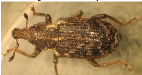
Annual bluegrass weevil adult

Seasonal dynamics of ABW and entomopathogenic nematodes are being studied on golf course fairways that are not