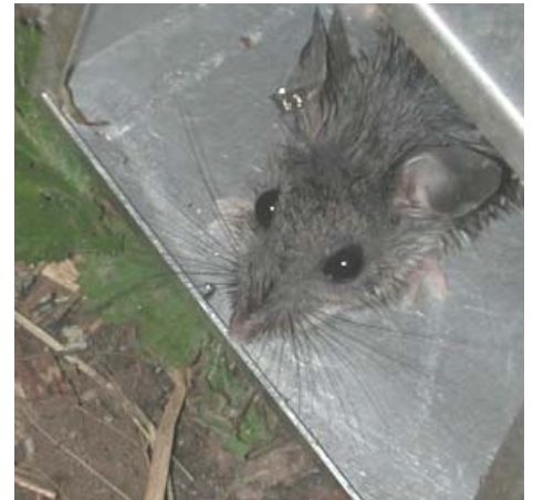
During the period of study, nine species of small mammals were captured on the golf course tree islands including deer mice ( Peromyscus maniculatus ).

on the golf course have much larger home ranges than do mice living in the woodland. To measure home range, we note the individual capture locations of each mouse and use those data to calculate a minimum convex polygon home range, analogous to the minimum area the animal must be using in a particular habitat. Then by tallying differences between mice, we are able to look at how mice behave on the golf course relative to in the nearby woodland.