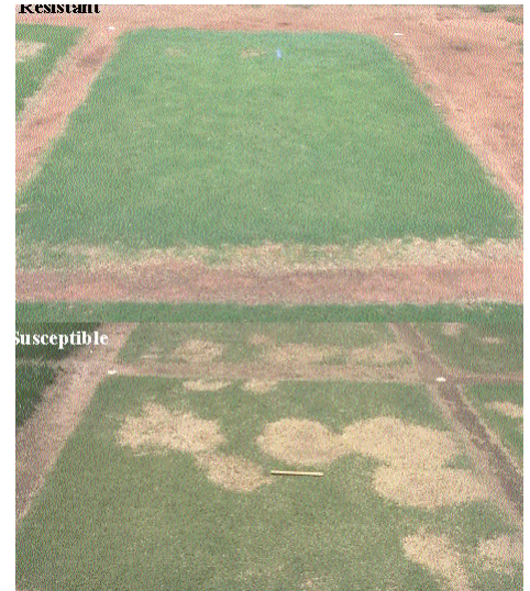
Researchers believe that by inoculating bermudagrass seedlings with Bacillus subtilis , this may make the bermudagrass host resistant to infection by the SDS pathogens.

We are in the process of obtaining the 16S-intergenic sequence from the most potent of all antifungal isolates. We have successfully purified and identified two antifungal peptides from the inoculation media of one potent antifungal bacterium (AF1). In addition, we were successful in purifying some additional unknown peptides with antifungal activity and are in the process of performing structural determi-