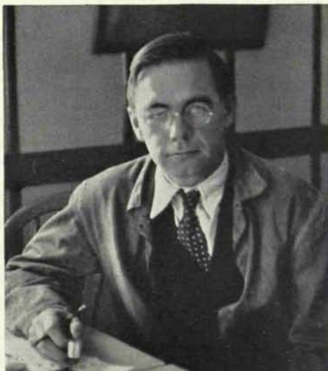
PROF. LAWRENCE S. DICKINSON

In much used sections of a park, and particularly in the shaded areas, the health of the turf does not depend so much upon the soil and fertilizer as it does upon the amount of air in the soil. Constant tramping by the visitors so thoroughly packs the soil that the air is driven out, and the surface rendered impervious to water. A turf in such condition must be aerated by spiking, discing or lifting before much benefit can be obtained from fertilizers.