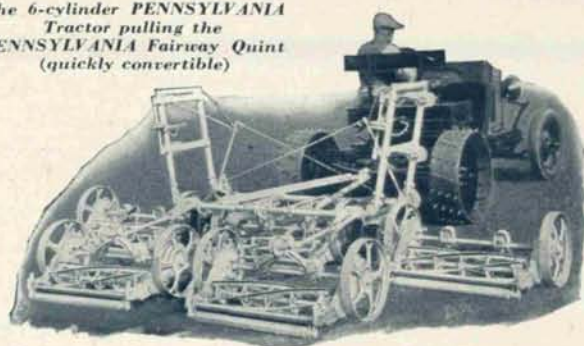
The 6-cylinder PENNSYLVANIA Tractor pulling the PENNSYLVANIA Fairway Quint (quickly convertible)