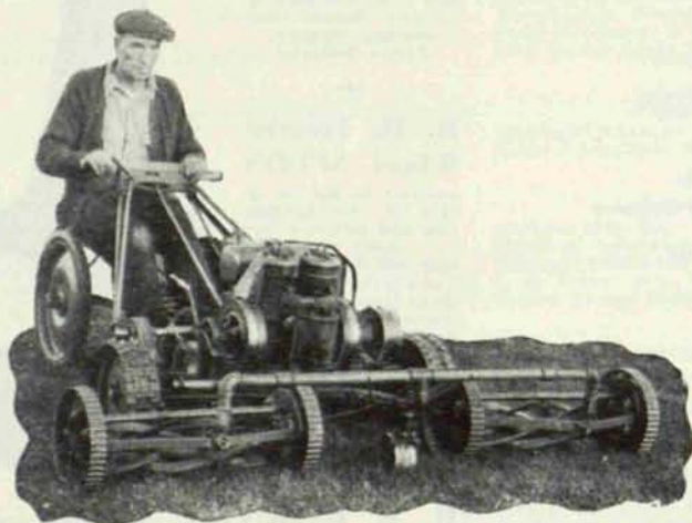
NEW JACOBSEN HEAVY DUTY MOWER

The operation is simple as it is completely controlled