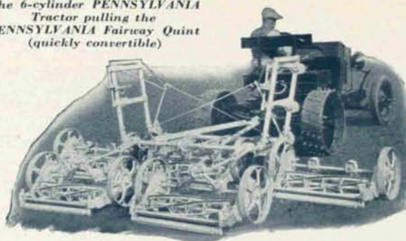
The 6-cylinder PENNSYLVANIA Tractor pulling the PENNSYLVANIA Fairway Quint (quickly convertible)