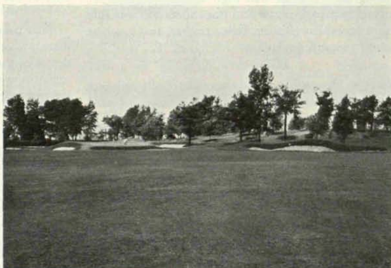
No. 14 at Beverly—326 Yards