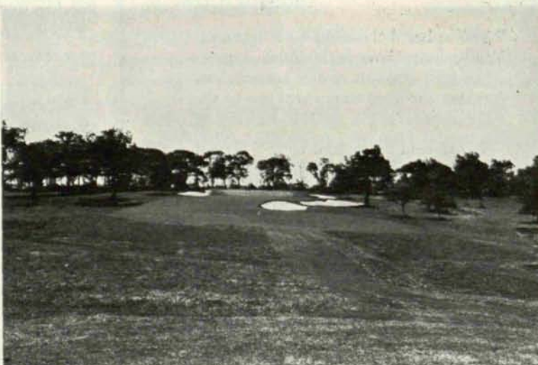
No. 17 at Beverly—200 Yards