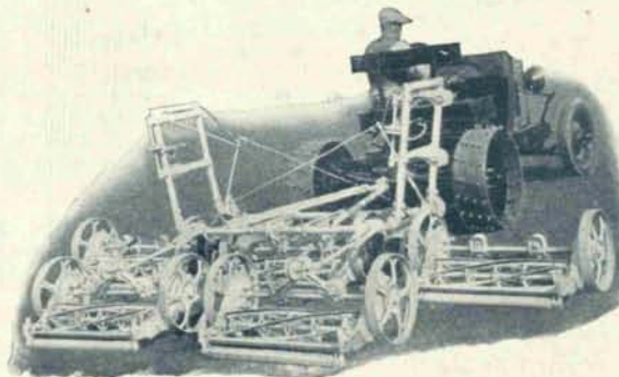
The 6-cylinder PENNSYLVANIA Tractor pulling the PENNSYLVANIA Fairway Quint (quickly convertible)

The first gang mower built to automotive standards