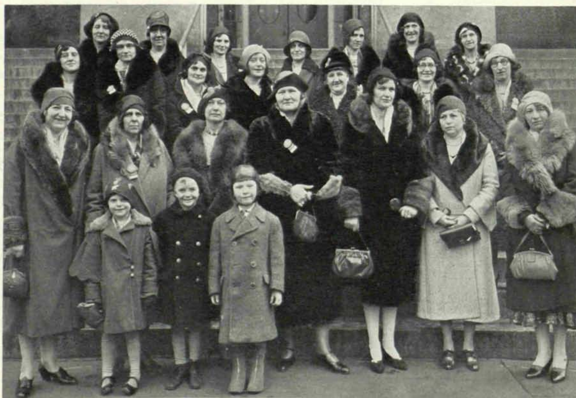
WIVES OF NATIONAL GREENKEEPERS ASSEMBLED AT COLUMBUS CONVENTION

One of the most important manufacturers of charcoal for use on golf courses, lawns, and athletic fields is the Cleveland Charcoal Supply Company, 3905 Jennings Road, Cleveland, Ohio. It is called Cleve-Brand Soil Improvement charcoal and those who are interested in better turf are requested to write them at the above address.