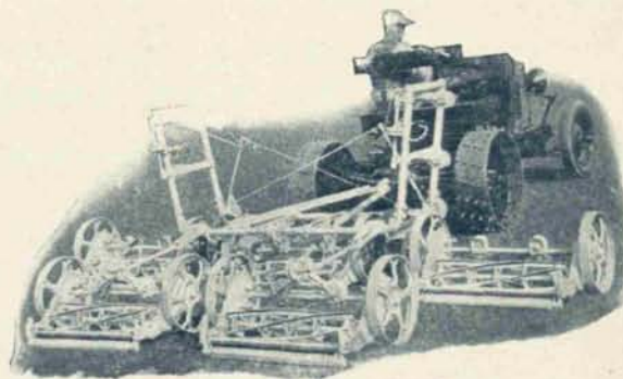
The 6-cylinder PENNSYLVANIA Tractor pulling the PENNSYLVANIA Fairway Quint (quickly convertible)

"Your Tractor Has Paid for Itself in one Year's Operation"