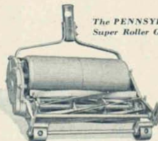
The PENNSYLVANIA Super Roller Greens Mower