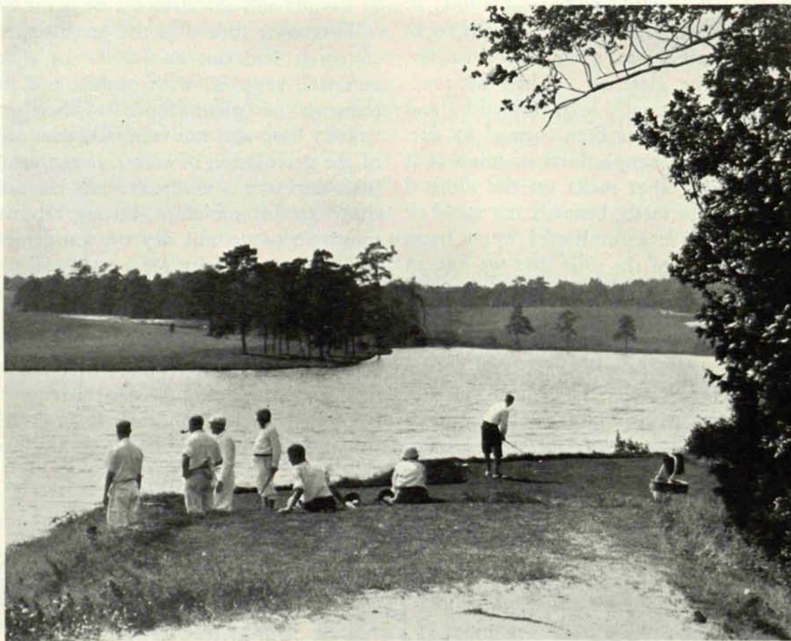
THE 15th TEE AT PINE VALLEY, CLEMENTON, N. J. This is a three-shot hole and every shot must be hit on the nose

But we have had the 18-day diet, sun tan, and now Tom Thumb golf. Next!