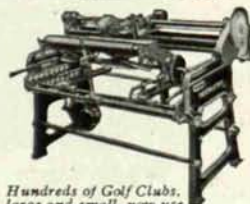
Hundreds of Golf Clubs, large and small, now use the Peerless Lawnmower Sharpener.

Special Grinding Wheel Attachment for sharpening grass shears, sickles, scythes, axes, etc. Skate Sharpener attachment sharpens all makes of skates—including hockey. Earns money all the year 'round. Will save its cost the first season. Write for Catalog and list of users.