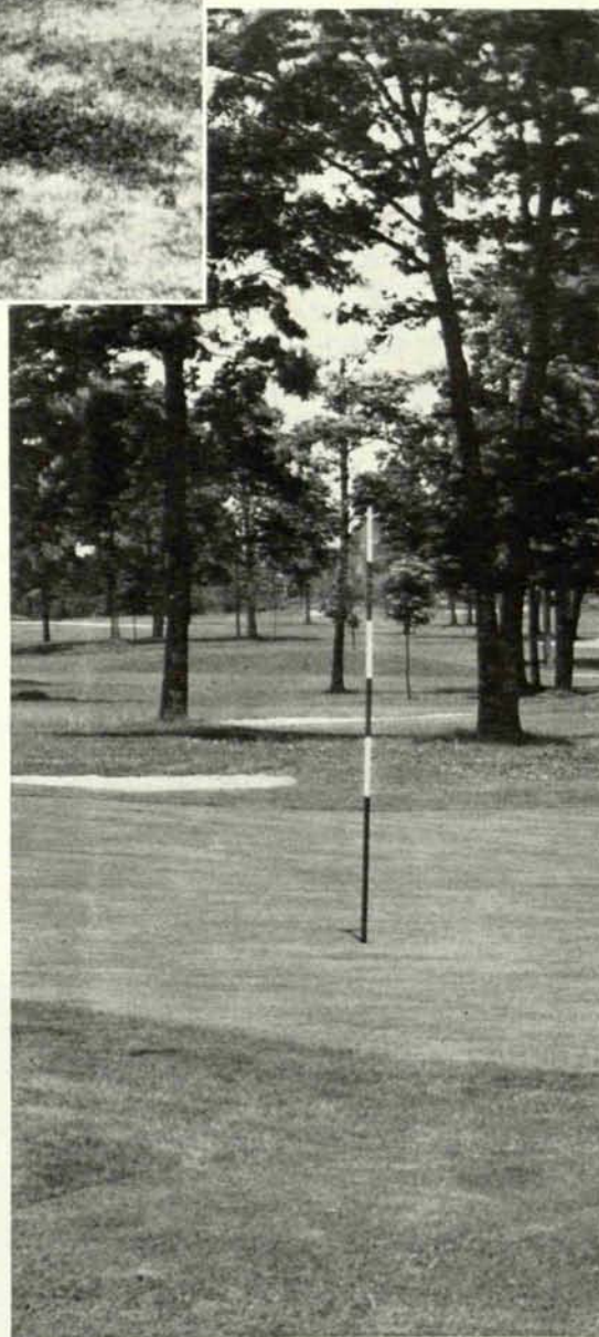
Regular treatment kept this green free from brown patch. The small panel illustrates damage done to turf by the disease.