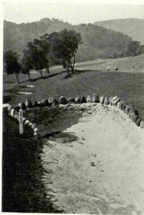
A CATCHBASIN THAT INTERCEPTS THE SURFACE WATER IN THE DRAW ABOVE FAIRWAY NO. 8 ON THE ORINDA GOLF COURSE AT OAKLAND, CALIFORNIA

FLOOD prevention on low areas is a special drainage problem sometimes encountered on low land which is subject to flood water