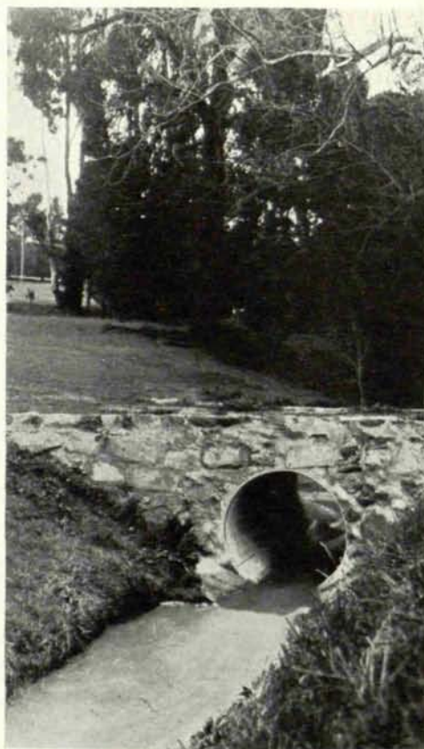
THIS SMALL STREAM ON THE CLAREMONT COUNTRY CLUB OF OAKLAND, CALIFORNIA, IS CROSSED BY A CORRUGATED IRON CULVERT BRIDGE. Stone masonry head walls give a rustic appearance that harmonizes with the immediate surroundings

frequent intervals prevent the accumulation of enough water to damage the draw. After such a pipe has been in operation long enough, the sod will become established firmly enough so that it will absorb more and more of the water passing over it, especially if the pipe