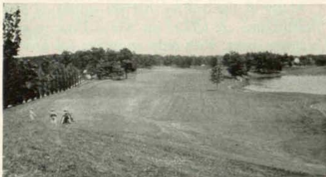
LOOKING DOWN NO. 1 FAIRWAY AT INTERLACHEN

Jimmy further asserted that "Interlachen" is not likely to be burned up by any of the boys. The course calls for a wonderful variety of shots and accuracy will be the principal requirement for scoring. Contestants who have mastery over their long irons will have an advantage, for they will be playing to narrow and small greens—and none of them will get more distance than they earn off the tees, or with their second woods. The fairways, always kept in fine condition by the splendid watering system, will not be baked as are so many courses in mid-summer. The greens will be fast and difficult because of the trickery of bent grass."