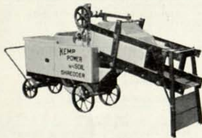
KEMP SOIL SHREDDER

The accompanying illustration shows the power shredder which is