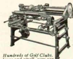
Hundreds of Golf Clubs, large and small, now use the Peerless Lawnmower Sharpener.

Special Grinding Wheel Attachment for sharpening grass shears, sickles, scythes, axes, etc. Skate Sharpener attachment sharpens all makes of skates—including hockey. Earns money all the year 'round. Will save its cost the first season. Write for Catalog and list of users.