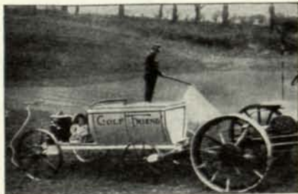
One of the smaller sprayers at work, driving a fine spray into sod of putting green with special Golf Gun.

"I have put over a very hard problem here on this course which all the members and directors are very proud of and they all treat me very fine. They are the best people I have ever worked for. We have a 27-hole course, and two big practice greens and everything is up-to-date. The first nine is called the red