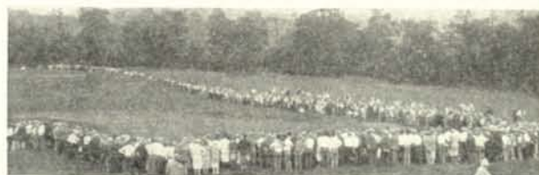
"Beautiful Turf from Tee to Green"

Every possible condition should be noted for each general problem. In other words the