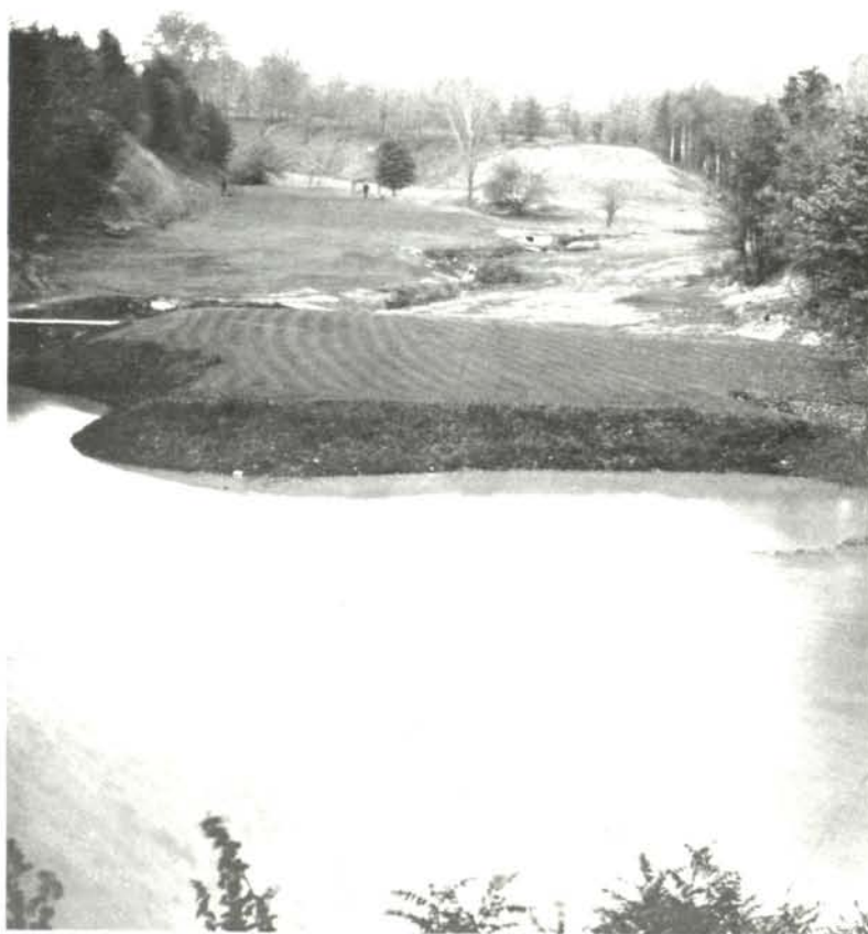
NO. 15 ON THE NEW MANAKIKI COURSE NEAR CLEVELAND

This picturesque one-shot hole is 200 yards from the back tee. Donald Ross was the architect and builder.