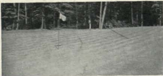
No. 16 green at Acacia. Rated finest on course. Lecco and sand turned the trick.

Complete Information And Price List of Any Guaranteed Product Sent On Request.