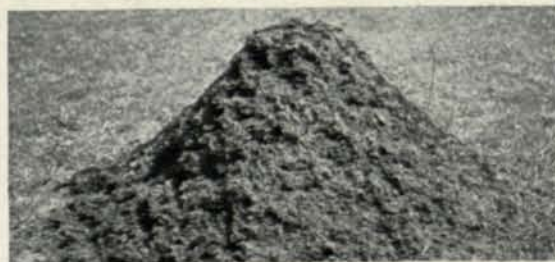
Eight catchers of grass cuttings like this pile mowed from No. 16 green every morning