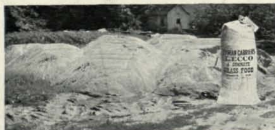
Lecco and sand have replaced Compost Pile at Acacia. No trouble. Less cost. Perfect turf