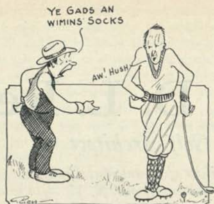
"—a golf playin' fellow happened by"

Well, one day I was up around the house and one of these golf playin' fellows happened by. Now, to me, just out of the sage-brush and the land of chaps and latigo straps, high-heeled boots and janglin' spurs, them pant-things and women's stockin's sure looked right queer. But I got to talkin' to the fellow what was wearin' of 'em, and I asked him what he was wearin' that kind of clothes for, and he says 'We dress this way when we play golf,' and I says "What's golf?" and he tells me what it's like only after awhile it sorta begun to blow in that you didn't use a baseball and bat but a little ball about an inch thru, and a stick with a knot on the end of it to knock the ball as far as you could, so you could go out there and whack it again.