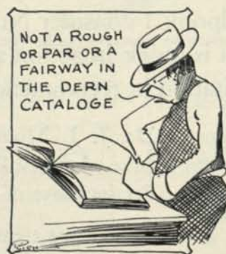
"—I looked thru Montgomery Ward's catalog"

Providence had sure put the finishing touch on my feeble effort in golf-course building. Now