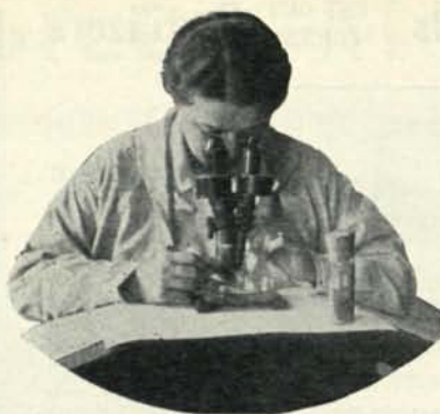
The Author in Her Laboratory