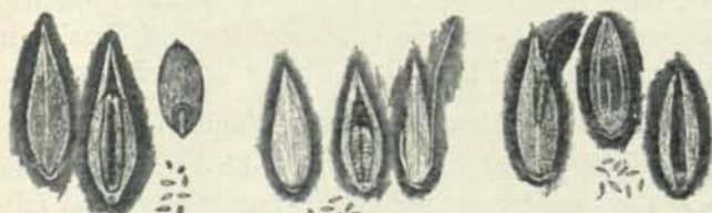
Agrostis Alba (Redtop) Agrostis Vulgaris (Rhode Island Bent) Agrostis Canina (Velvet Bent)