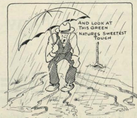
"—it rained for three solid days"