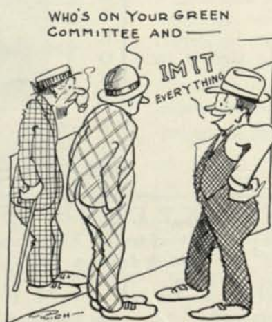
"—a man is judged by his scars"