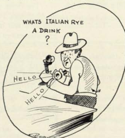
"—only thing he could recommend was Italian rye"

I know I will not be able to reciprocate in full, but this is to serve notice on you that I shall always feel I owe you a debt of gratitude, on which I will never be able to any more than pay the interest.