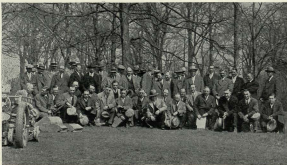
A GROUP OF CLEVELAND DISTRICT GREENKEEPERS AT THE COUNTRY CLUB DEMONSTRATION