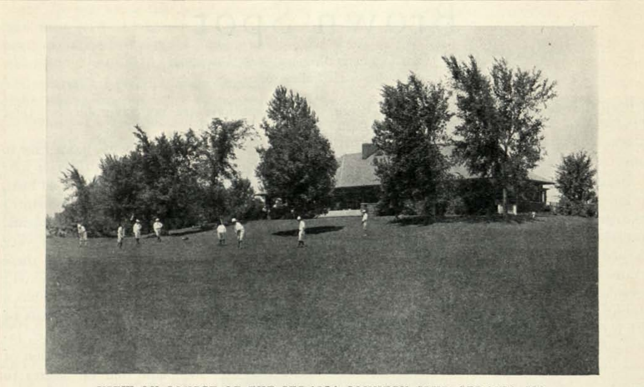
VIEW ON COURSE OF THE SEDALIA COUNTRY CLUB, SEDALIA, MO.

so pleasing to look at, that we can hole out, is dispensing as much real joy and satisfaction as any mortal living. I often feel that the greenkeeper is not appreciated. I have seen business men rush out to the course and come up to a pretty green, make their putt and go on, without ever thinking or at least never expressing themselves that some man has rolled and tossed on his bed, so imbued with the idea of putting his work over with satisfaction to those who play golf.