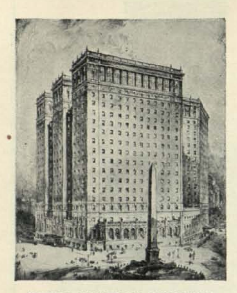
HOTEL STATLER, BUFFALO Cor. Delaware Avenue and Niagara Square

A BIG and successful affair! That seems to be the outlook for the Second Annual Greenkeepers' Convention and Golf Show to be held at Hotel Statler, Buffalo, February 13-16, 1929. These four days will be crowded with good times, educational conferences and discussions on greenkeeping problems, trips to Niagara Falls and Canada, to say nothing of the Golf Show with all its features. No greenkeeper no matter how far away he lives should miss it.