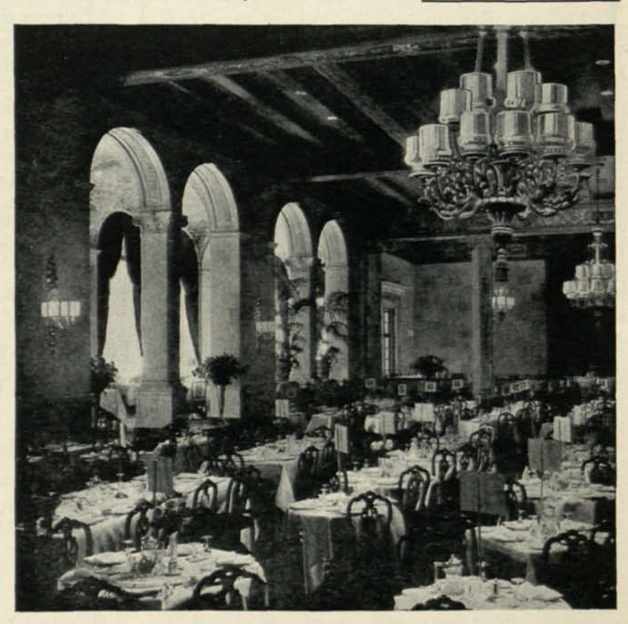
BALL ROOM OF HOTEL STATLER, BUFFALO Where the second Annual National Greenkeepers' Golf Show will be held February 13-16, 1929