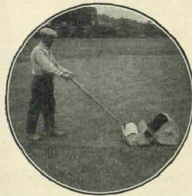
The Improved 1927 Model Super Roller Greens Mower.