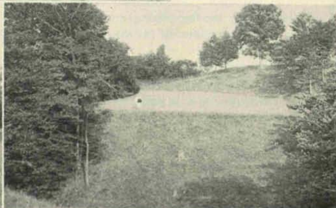
Upper, number 3 green, lower left number 13, and lower right, number 11, at St. Thomas Golf and Country Club, Union, Ontario, Canada