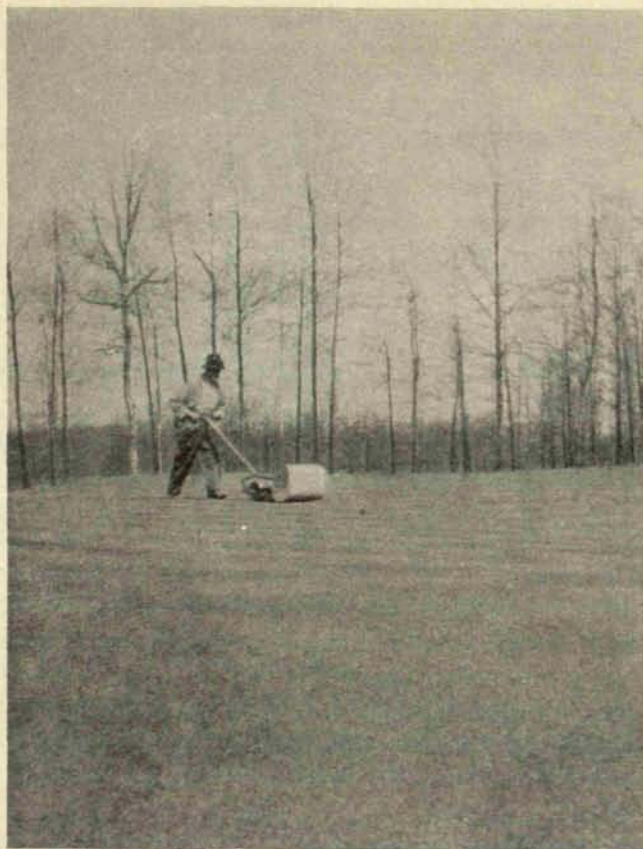
Cutting 'em Close at Sylvania

greens, well we've spent plenty on them. Weeds simply can't get through that turf, it's too thick and matted.