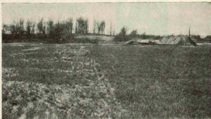
This Remarkable Turf produced in less than two months with Milorganite Seeded August 15th Photographed Oct. 5th

The first few weeks following seeding are most critical. In the presence of abundant plant food greater numbers of seedlings survive and a dense heavy turf results. In northern sections fertilized seedings make a heavier growth in the fall and can survive severe winter weather.