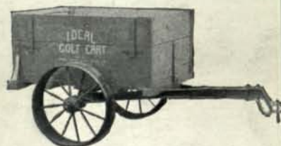
This is the Ideal Golf Cart, one of the handiest tools that any golf club can own. Sturdily built and has wide 10" crown wheels.