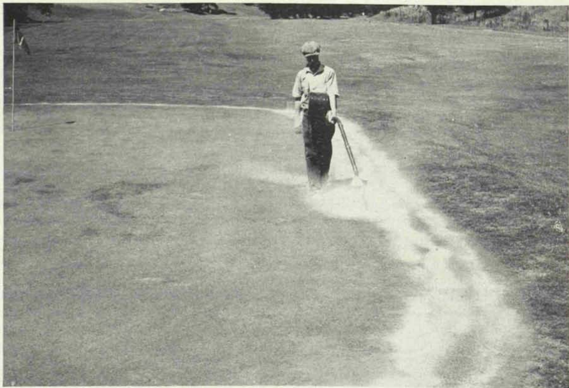
The grub worm menace affects all growers of fine turf. The cut on top shows the injury to turf by the English Starlings with an inset indicating an example of injury nearly natural size. The lower cut illustrates the application of arsenate of lead with a rotating fan duster. This work must be done when there is little wind blowing.