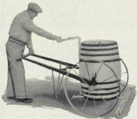
DOLGE DEMOUNTABLE SPRAY BARREL

ing and because of this reason has met with favor with the greenkeepers. For use in the clubhouse rest and toilet rooms there will be on display the new Pervasif and Diffuser, the