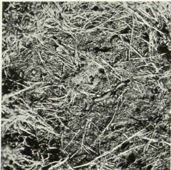
CLOSE-UP VIEW OF SOD WEBWORM

A SECONDARY effect following the scourge of sod webworms is the destruction of turf wrought by birds in the process of feeding on the insects. Robins do not disturb the turf to the extent that grackles and English starlings do. The starlings in particular have the pernicious habit of pulling up