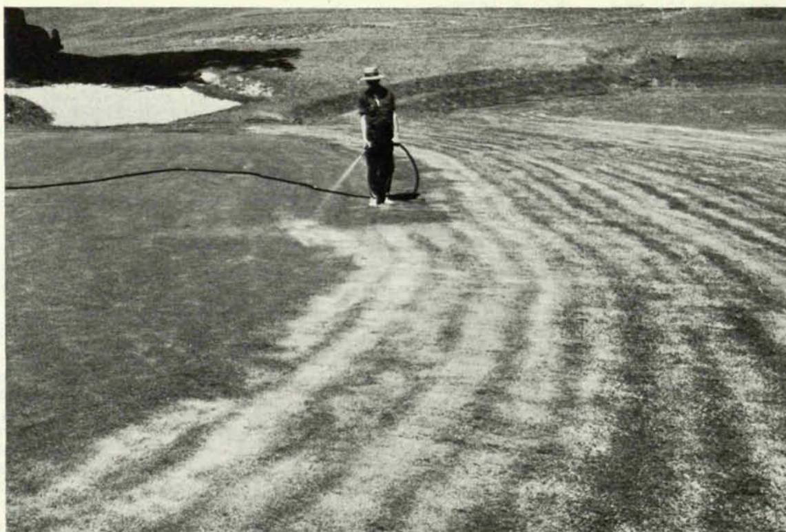
WATERING IN THE ARSENATE OF LEAD AFTER IT HAS BEEN APPLIED AND BRUSHED IN A hard-driving spray is best. Do not use the regular sprinkling system for this purpose.

The work to date we consider of a preliminary character, and further work, as the opportunity presents itself, may result in the development of a modification of the control suggested at this time,