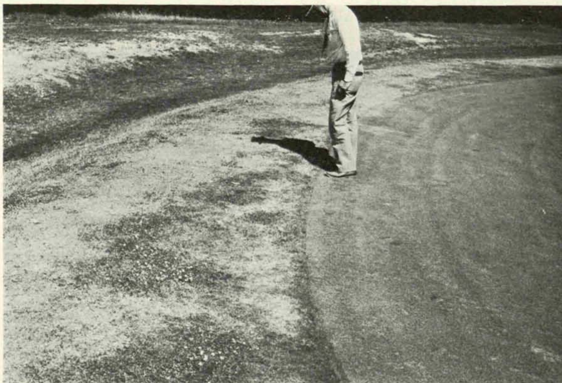
VIEW OF THE APRON AND GREEN SHOWING WORK OF SOD WEBWORM

Insert shows an example of injury nearly natural size.