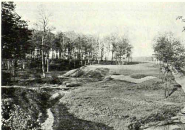
NO. 14 AT THE WESTWOOD COUNTRY CLUB, CLEVELAND

without water; as a result after the green was sprinkled it would show scald spots.