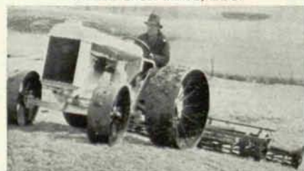
Heavy Rims, Easier Steering, Better Traction. Rounded Edges to Protect Turf.

Designed by a Golf Course Mechanic (SOLD IN SINGLES, PAIRS OR FULL SETS) Immediate Shipment EXTENSION RIMS, ETC.