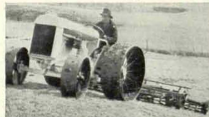
Heavy Rims, Easier Steering, Better Traction. Rounded Edges to Protect Turf.

Designed by a Golf Course Mechanic (SOLD IN SINGLES, PAIRS OR FULL SETS) Immediate Shipment EXTENSION RIMS, ETC.